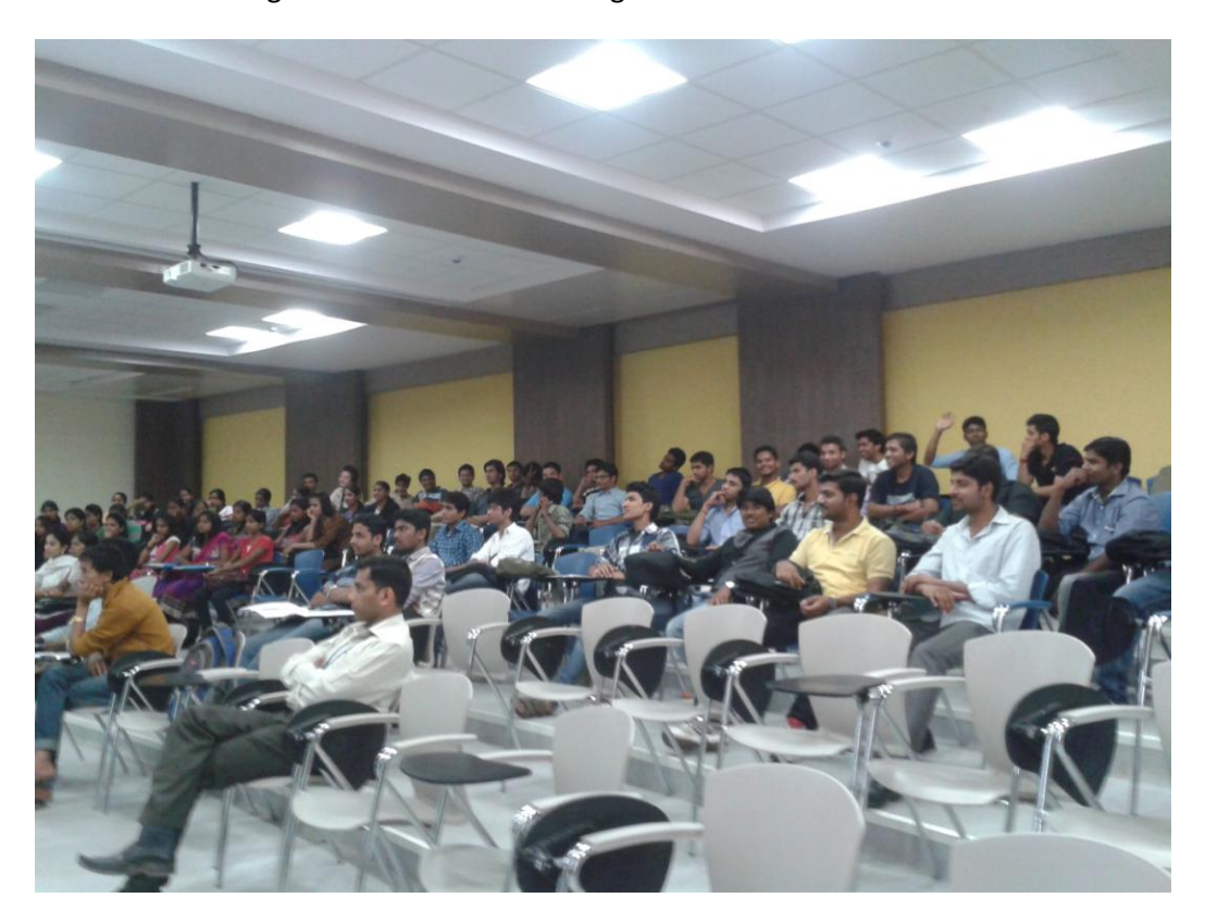
Students attending tutorial classes under QEEE